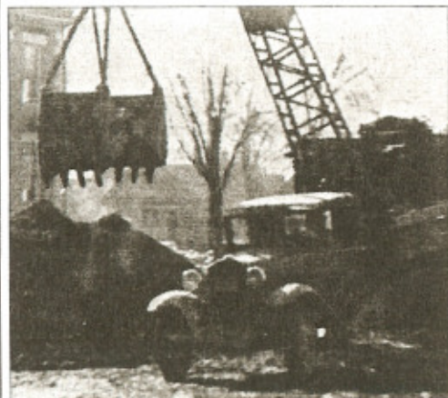
A crane lifts portions of the frame for what is now known as Changnon Gymnasium on the campus of Mt. Vernon Township High School.

Seventy-one years of history. And the tradition lives on.