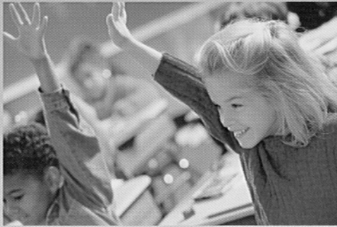
Teaching behavioral expectations to all students