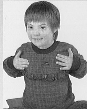
Acknowledging appropriate behavior