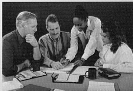
Function-based support for students with chronic problem behavior