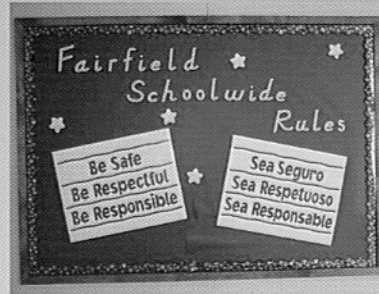
School-wide behavioral expectations