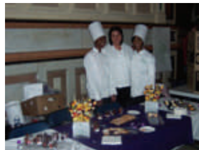
Culinary students with their table display